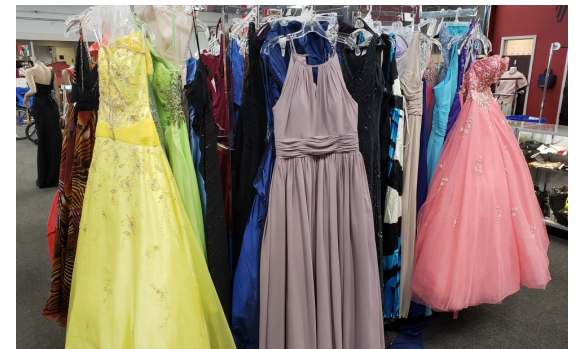
Stuff's prom dress selection for 2020.

You're only in high school once. Sure the musics not be great to some, or you don't like dressing up.