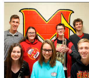
Members of All-State choir and band happily pose for a picture.